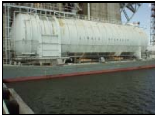
Figure 2. One of Stennis' three 270,000-gallon liquid hydrogen barges shown docked at the B1/B2 test facility.

Since being put into service in the mid-1960s, Stennis' six liquid oxygen barge vessels have been partially recertified using engineering analyses on the inner vessel. Unlike the liquid hydrogen barge vessels, Stennis did not waive the recertification requirement for the liquid oxygen barge vessels. Further, Stennis did not exempt the liquid oxygen barge vessels from the recertification requirements of its operating procedure for recertifying