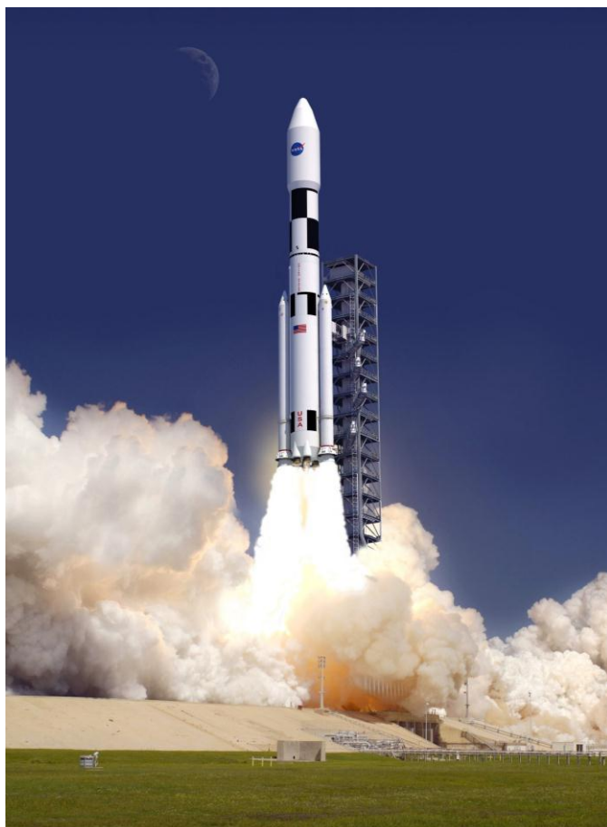
Figure 2: Artist Concept of Space Launch System