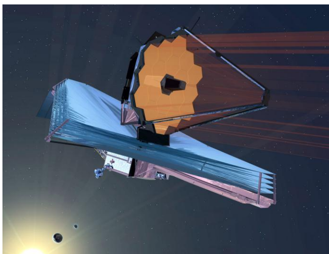
Figure 3: Artist Concept of James Webb Space Telescope

The observatory is designed to help understand the origin of the first stars and galaxies in the universe, the evolution of stars, and the formation of stellar systems and nature of objects in our own solar system. JWST consists of a 25-square-meter mirror composed of 18 smaller mirrors, an integrated science instrument module that houses the telescope's four instruments, and a tennis-court size sunshield. JWST's instruments are designed to work primarily in the infrared range of the electromagnetic spectrum, allowing for unprecedented observing capability. 20