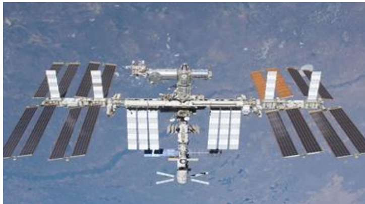
Figure 1: International Space Station

NASA officials have indicated they intend to maintain the ISS budget between $3 and $4 billion per year through 2024. In our judgment, this estimate is based on overly optimistic assumptions and we believe the cost to NASA will likely be higher. First, much of the projected cost increase is attributable to increased transportation costs, but we found NASA's estimate for transportation costs unrealistic. Specifically, NASA's estimates for the cost of the commercial crew transportation services are based on the cost of a Soyuz seat in FY 2016 – $70.7 million per seat for a total cost of $283 million per mission for