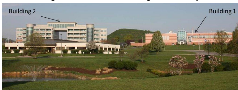
Figure 5. NASA IV&V Program Facility

responsible for associated operations and maintenance (O&M) expenses. Nevertheless, NASA has continued to pay the facility’s O&M costs, which over the last 20 years have amounted to more than $82 million. Moreover, although NASA does not own the facility, the IV&V Program paid the Corporation $993,000 in 2010 to replace its roof.