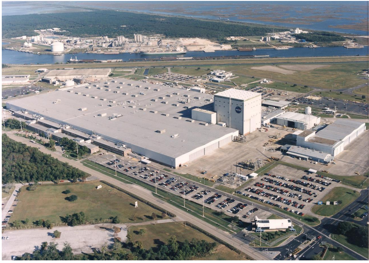
Figure 1: Aerial View of the Primary Manufacturing Facility at Michoud