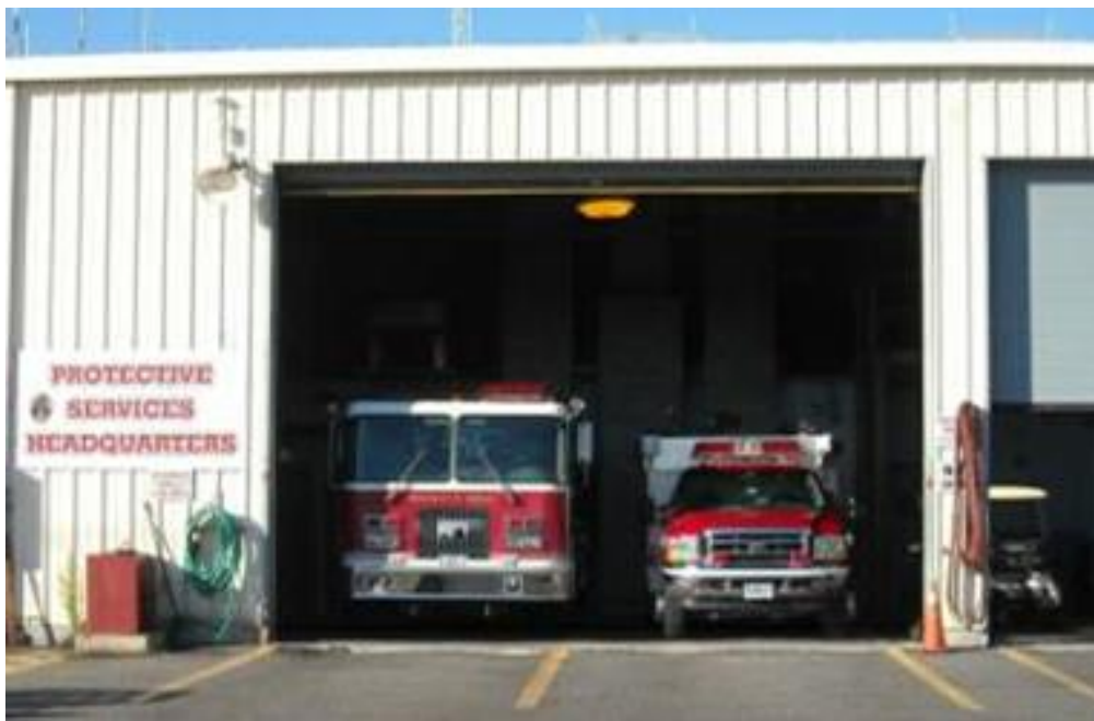
Figure 3: Fire Vehicles at the Michoud Fire Station

In addition to the use of the Fire Station located on the Facility, Michoud provided the City with use of two fully-equipped fire vehicles (Figure 3 shows the vehicles parked at the Michoud Fire Station). The Fire Department was responsible for providing any additional vehicles or equipment needed in case of a larger fire event.