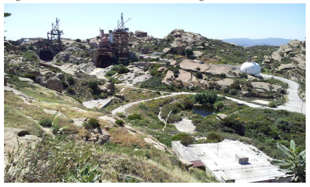
Figure 2 - NASA Test Stands and Surrounding Area at SSFL