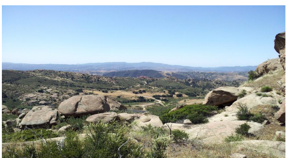
Figure 4 – View of Area Surrounding SSFL

According to NASA, DOE, and Boeing officials, excavation and removal of contaminated soil could result in unplanned human and environmental health risks due to increased truck traffic, creation of additional access roads into the property, damage to residential and public roadways, air pollution, and contamination due to debris falling off the trucks. In addition, removing the projected amount of soil may significantly alter the natural beauty of the property. See Figure 4 for a view of the area surrounding the SSFL.