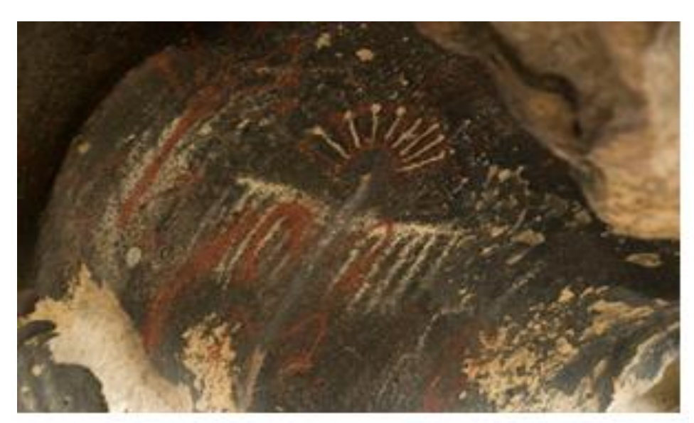
Figure 5 – Pictographic Art from Burro Flats Painted Cave